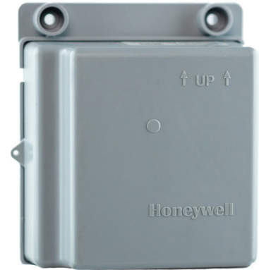
Remote-mount NXCM Gas module.

Supporting AES-128 bit encryption, the Smart Gas module protects its data and communications with enterprise strength technology.